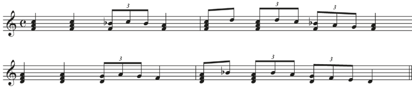
Fig. 8. Musical example 3. “Osetinskaya”. Performed by Rustam Sheudzhen. Music notation by A. N. Sokolova

different height — a third lower. A major-minor “modulating” construction is created by ear (fig. 8).