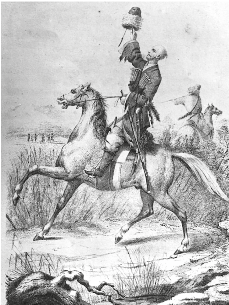
Fig. 9. "Khedgeret". See: Popko, Ivan. Black Sea Cossacks in Their Civil and Military Life. Essays on the Edge, Society, Armed Forces and Service. In Seventeen Stories, With an Epilogue, A Map and Four Drawings from the Life (St. Petersburg: s. n., 1858), 276

The "dance with daggers" has remained in the modern culture of the peoples of the Caucasus as a vestige of ancient military exercises, as a sign of the historical past and as a demonstration of the image of an ideal man, from the point of view of the mountain mentality. The multilayered literary text of the "dance with daggers", the mass of explicit and hidden information codes contained in it, the special skill required for its execution, the aesthetic sculptural beauty of the movements make this dance phenomenal for all peoples of the Caucasus. At the same time, the dance is a product of the Soviet period, in which people managed to encode a significant number of signs and symbols, maintaining a connection with the past that allowed for enhancement of ethnic identification. During the period when new (Soviet) ideals and values were affirmed, everything old (traditional) was declared obsolete, archaic, and worthy of destruction. The Circassians in the "dance