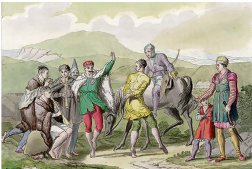
Fig. 1. "Dances of Circassians". 1818. Based on illustrations of E. M. Korneev in the book "Peoples of Russia". The sheet was published by D. Ferrario in 1818 (Ferrario, Giulio. Il costume antico e moderno, o, storia <...> di tutti i popoli antichi e moderni <...> (Firenze: Pen Vincenzo Batelli, 1824), vol. 3). Aquatint. Sheet: 36×26.5. Image: 29×21. Engraver: Biasioli, Angelo (1790–1830) Italy / Milano, Verona. Painter: Palagi, Filippo Pelagio (1775–1860). Italy / Bologna, Turin

It is also possible to find images of a pair of male dances in the drawings of Italian and Russian artists. It is noteworthy that men dance barefoot and without weapons. Performances of dances barefoot are still found among the Circassians of Turkey and Russia as they are often used to mark an important event in the dancer's life or the fulfillment of his dream/desire. For example, a person could make a promise (swear an oath) to his relative or friend, to someone who refrained from marrying for a long time: "If you finally marry, I will dance barefoot at your wedding" ( КІалэм къизицэкІэ ламцІзу сыкъгъэшгоцт ). From people who survived the war, it is possible to hear: "I told a neighbor that if I get a letter from my husband at the front, I will dance barefoot" (fig. 1).