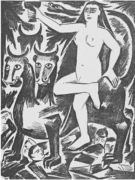
Fig. 5. Natalia Goncharova. The Virgin on the Beast, from “Mystical Images of War”. 1914

His relatively rare graphic works, in comparison with Dix and Gross, speak about the atmosphere of apathy and disappointment that gripped Germany in the 1920s, and also reflect the general mood of the artistic movement known as the “New Objectivity” ( Neue Sachlichkeit ).