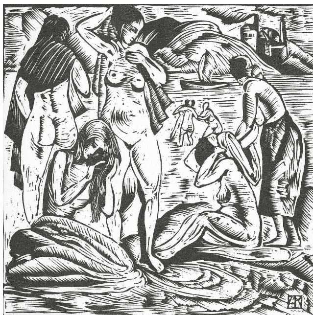
Fig. 7. Alexei Kravchenko. Bathing. 1919

In addition to Kupreyanov and Kravchenko, the images of some engravings by Andrey Goncharov, a disciple of Favorsky, can also be considered expressionistic. In particular it is worth mentioning his portraiture, namely "Self-Portrait" and "Portrait of an Old Woman" (Fig. 8). But, again, at all