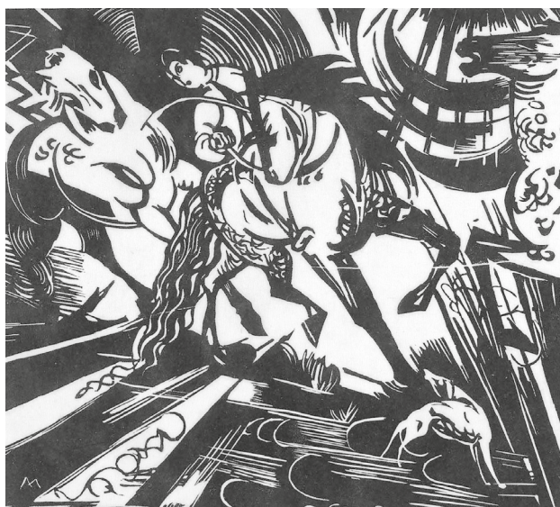
Fig. 2. Franz Marc. The Riding School. 1913

ment in the future. And as for the deep black color in combination with the neutral “white” paper surface, this unusually expressive contrast has become something fundamental to the graphic style of the 20 th century. Thanks to the style and manner of everyday scenes — expressionists’ scenes — turned into a gloomy or feverishly joyous phantasmagoria, where expression is sort of detached from the narrative and the image.