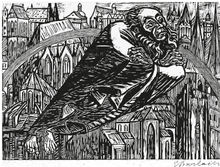
Fig. 3. Ernst Barlach. The Cathedrals, from “The Transformations of God”. 1920—1922

In the Expressionist graphics there was also a stylization when they interpreted the techniques of the early German woodcuts of the 15th century, or the images of African “tribal art”. As for parallels with the German Gothic tradition, they are evident in a series of woodcuts by Ernst Barlach of 1919–1922, where an original image of medieval religious art is realized (Fig. 3).