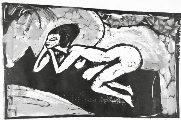
Fig. 1. Erich Heckel. Lying on a Black Cloth. 1911