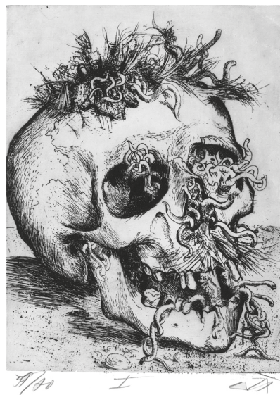
Fig. 4. Otto Dix. The Skull, from “The War”. 1924

In response to the First World War, German artists continued the tradition of printed cycles depicting the war and its consequences (historically the best-known example is “The Disasters of War” by Francisco Goya). Thus, indelible impressions leave disturbing images in a series of etchings of Otto Dix called “War” (1924), created under the influence of his own military experience (Fig. 4). The shocking, sharp graphic of expressionism became an instrument of agitational and satirical graphics during the years of the First World, whose singular representative was Georg Gross, with his grotesque, socially pointed images, perceiving the surrounding reality as pathology, a disease. Another bright representative of the following (after the participants of Die Brücke and Der Blaue Reiter groups) was the generation of German expressionists, whose military experience played a significant role in his artistic formation, was Max Beckmann.