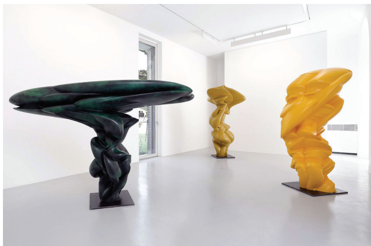
Fig. 2. Tony Cragg exhibition. 2015. Lisson Gallery, Milan