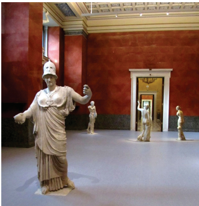
Fig. 5. Antony Gormley. Still Standing: A Contemporary Intervention in the Classical Collection. 2011–2012. The State Hermitage Museum, St. Petersburg