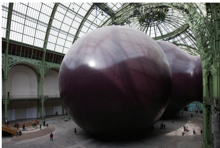
Fig. 4. Leviathan. 2011. A. Kapoor. Grand Palais, Paris

own fantasy and the basis for them is my emotion about the form I'm making. [...] That's very easy technology, and there are lots of programs through which you can actually move one form onto the other.'