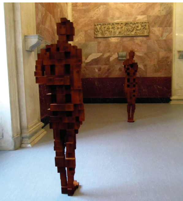
Fig. 6. Antony Gormley. Still Standing: A Contemporary Intervention in the Classical Collection. 2011–2012. The State Hermitage Museum, St. Petersburg