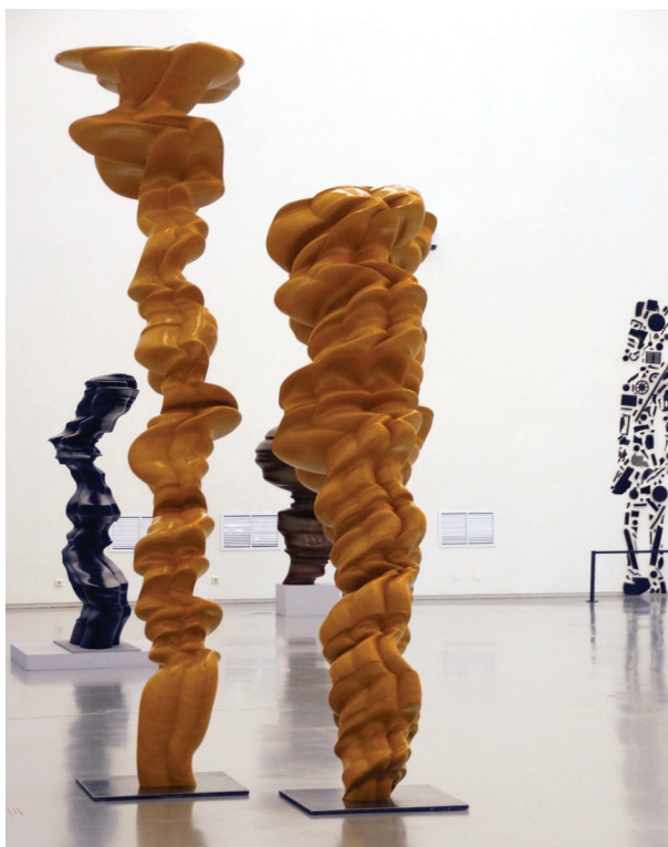
Fig. 1. Tony Cragg. Sculptures and Drawings. 2016. The State Hermitage Museum, St. Petersburg