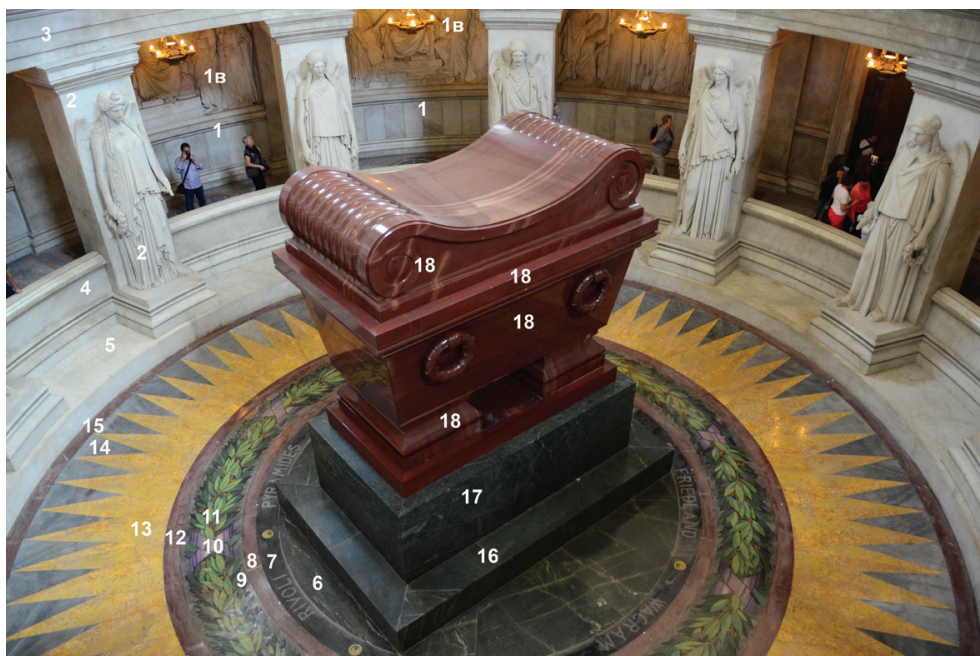
Fig. 1. The crypt and the tombstone of Napoleon

1–5 — Carrara white marbles; 1b — Bas reliefs by P.-Ch. Simart; 2 — Statues by J. Pradier; 6, 16, 17 — Mont Thillet (Ternuay, Vosges) green andesite; 7 — black marble “ St Lucie ”; 8, 10, 12 — red marble “ Griotto ”, presumably from the Pyrenees (Campan); 9, 11, 13 — white marbles incrusting with small colored enamel plates; 14 — Grey marble, presumably “ Lunel Fleury ” (Boulogne, Northern France); 18 — Purple Shoksha (Russia) quartzite