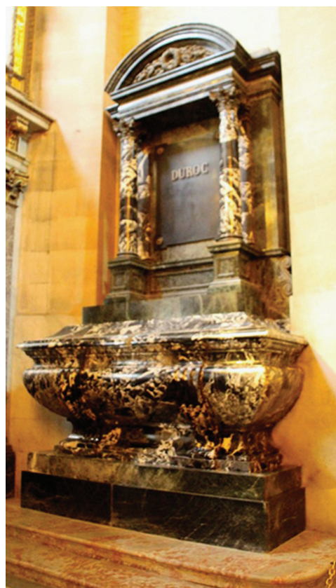
Fig. 2. The Tombstones of Bertrand (left) and Duroc (right) Marbles “ Grand Antique ” (columns and tombs), “ Brèche Napoléon ” (bases of the columns and the top of the tombs), and the black marble is presumably “ St Luce ” (plates with the names)