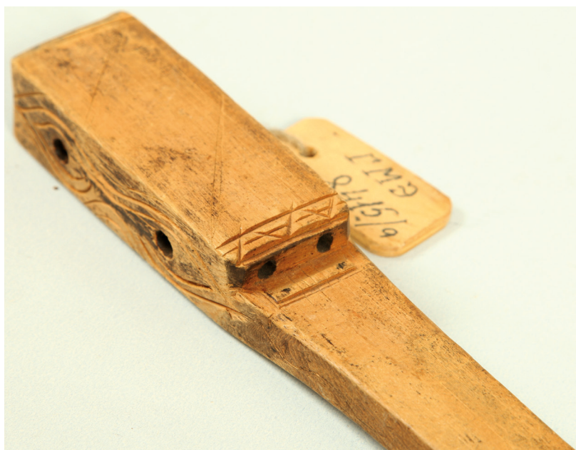
Fig. 17, 18. Igil ("ihil"). Tuvinians (Todzhinets). RME, inv. № 8761-8415/ab