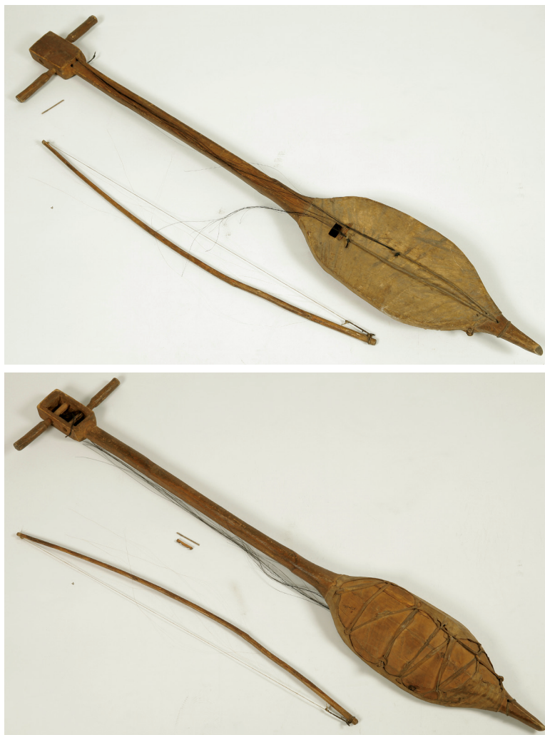
Fig. 1, 2. Igil . Tuvinians ( Soyots ). RME, inv. № 633-38/ab