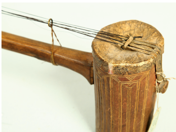
Fig. 9, 10, 11. Byzaanchy ("buzanche"). Tuvinians (Soyots). RME, inv. № 633–36/ab