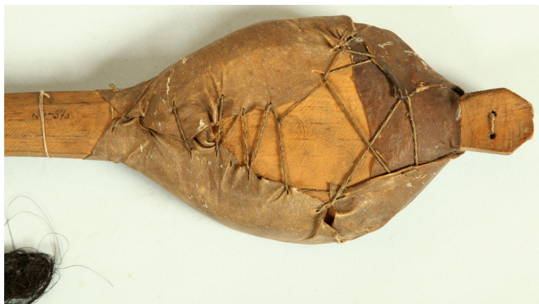
Fig. 3, 4. Igil . Tuvinians ( Soyots ). RME, inv. No. 633-37/abcd