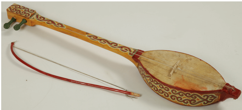
Fig. 19. Igil . Tuvinians. RME, inv. № 10064-69/ab

b) Bow “chadzh” (chazhak, in translation from the Tuvinian — bow ) of arch-shaped form, rod is well-cut curved branch, Some portion of black horsehair has remained. Pits for fastening hair are cut on the edge of rod.