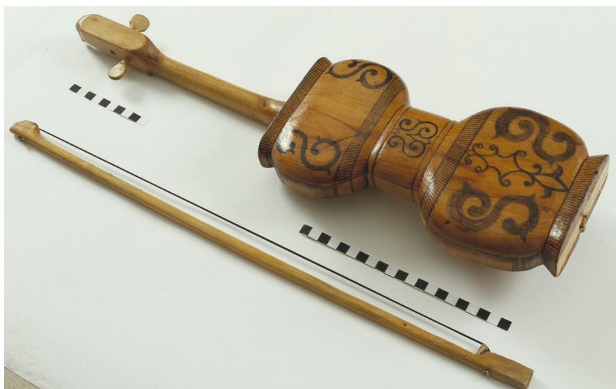
Fig. 20, 21. Kytiya Khyryppa . Yakuts. RME, inv. № 9915-72/ab

Nut cut and glued to basis of head. Peg box cut on face. Two tuning pegs of slightly conic shape with spade-like handles inserted on both sides of tuning peg box.