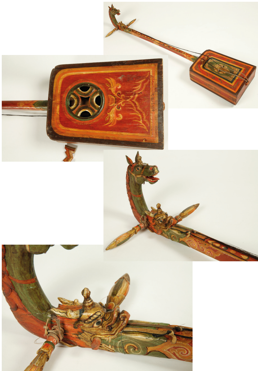
Fig. 13, 14, 15, 16. Khuur . Mongols. RME, inv. № 6957–16/ab