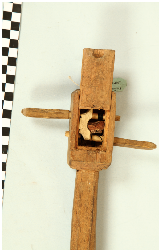
Fig. 5. Igil . Tuvinians ( Soyots ). RME, inv. No. 633-37/abcd

Tuning pegs with cylinder heads and rectangular handles with pointed end are inserted into tuning peg box from two sides. Heads of tuning peg with split at length to fasten strings.