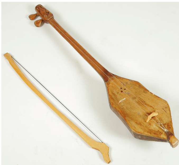
Fig. 8. Ikili-topshur . Altaians (Altai-Kizhi). RME, inv. № 12424-41/1, 2

Wood, leather, metal, fishing line, varnish