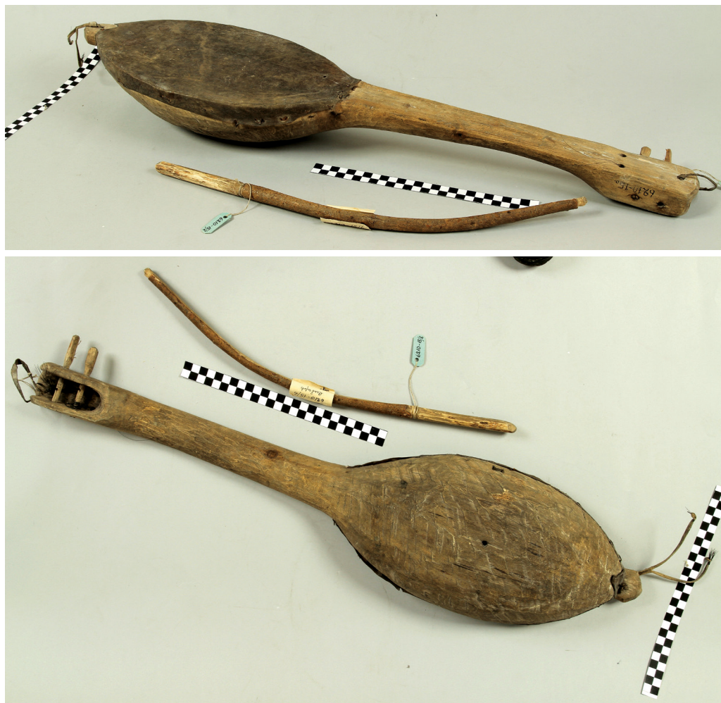
Fig. 6, 7. Ykh. Khakas ( Kachinets ). RME, inv. № 6210-15/ab

Neck narrows up and by the head it widens and transforms smoothly into head itself, Cavity hewed from backside of head. Head is open at top. Two holes for strings burnt out under small angle in lower part of head from backside to face. A pair of tuning peg holes burnt out on lateral sides.