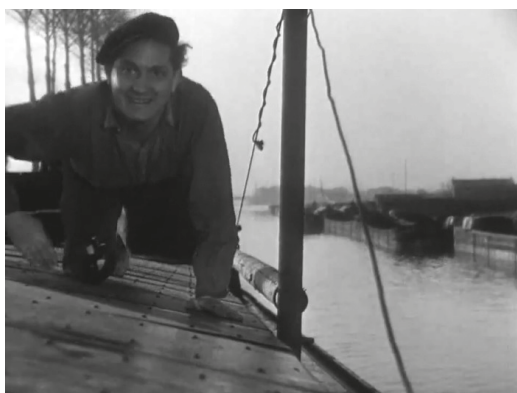
Fig. 4. The improvised shot from L'Atalante created the sense of an authorial presence of a cameraman holding the camera. L'Atalante , directed by Jean Vigo (1934; Paris: Gaumont, 2001), DVD