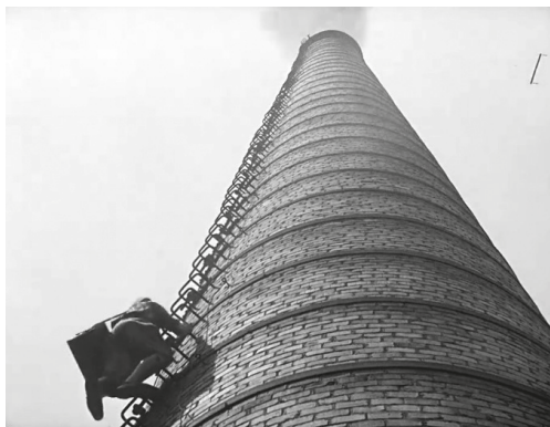
Fig. 1. The Man with a Movie Camera , directed by Dziga Vertov (1929; Paris: Arte vidéo: Scerèn, 2003), DVD