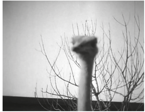
Fig. 7. A propos de Nice , directed by Jean Vigo and Boris Kaufman (1930; Paris: Gaumont, 2001), DVD