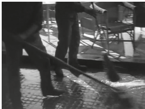
Fig. 11. A propos de Nice , directed by Jean Vigo and Boris Kaufman (1930; Paris: Gaumont, 2001), DVD