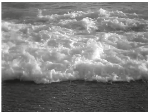
Fig. 10. Like Vertov, Jean Vigo created a dynamic visual rhythm by repeating and juxtaposing images that had some similar elements. A propos de Nice , directed by Jean Vigo and Boris Kaufman (1930; Paris: Gaumont, 2001), DVD