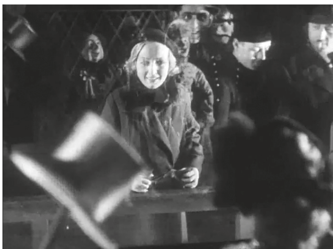
Fig. 5. L'Atalante , directed by Jean Vigo (1934; Paris: Gaumont, 2001), DVD