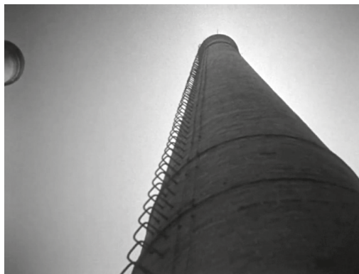
Fig. 2. A propos de Nice , directed by Jean Vigo and Boris Kaufman (1930; Paris: Gaumont, 2001), DVD