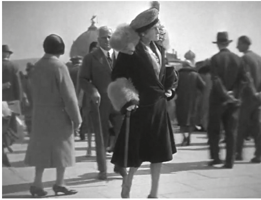
Fig. 6. A propos de Nice , directed by Jean Vigo and Boris Kaufman (1930; Paris: Gaumont, 2001), DVD