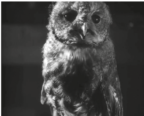
Fig. 8. Strike , directed by Sergei Eisenstein (1925; Paris: Carlotta Films, 2008), DVD