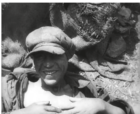
Fig. 3. The Man with a Movie Camera , directed by Dziga Vertov (1929; Paris: Arte vidéo: Scerèn, 2003), DVD