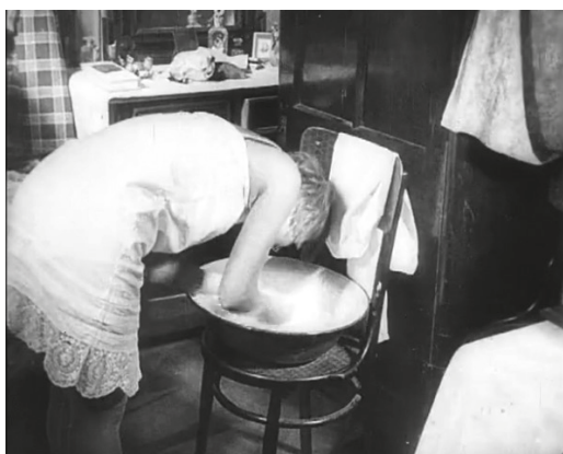
Fig. 12. The Man with a Movie Camera , directed by Dziga Vertov (1929; Paris: Arte vidéo: Scerèn, 2003), DVD