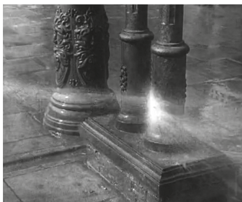
Fig. 13. The Man with a Movie Camera , directed by Dziga Vertov (1929; Paris: Arte vidéo: Scerèn, 2003), DVD

“Blue sky, white houses, bedazzled sea, sunshine, multicoloured flowers, hearts full of joy, such would appear at first the atmosphere of Nice. But this is only the ephemeral and transient appearance of a city of pleasures watched by death” [24, p. 20].